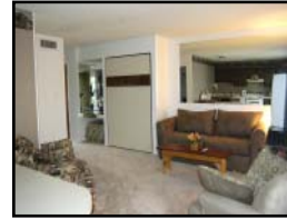
Living Room - Beds up