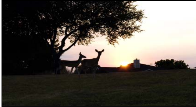
Deer strolling along the golf course at sunset

"Where Lake Travis meets Texas fun and Hawaiian hospitality!"