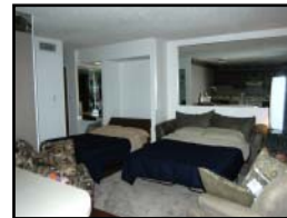
Living Room - Beds down